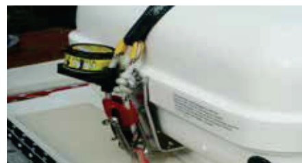
Deck mount with HRU