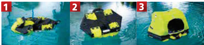
The automatically self-righting VIKING RescYou™ Pro is ready for boarding within seconds